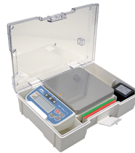
Carrying case (Shown with option HT-10 stainless steel pan)